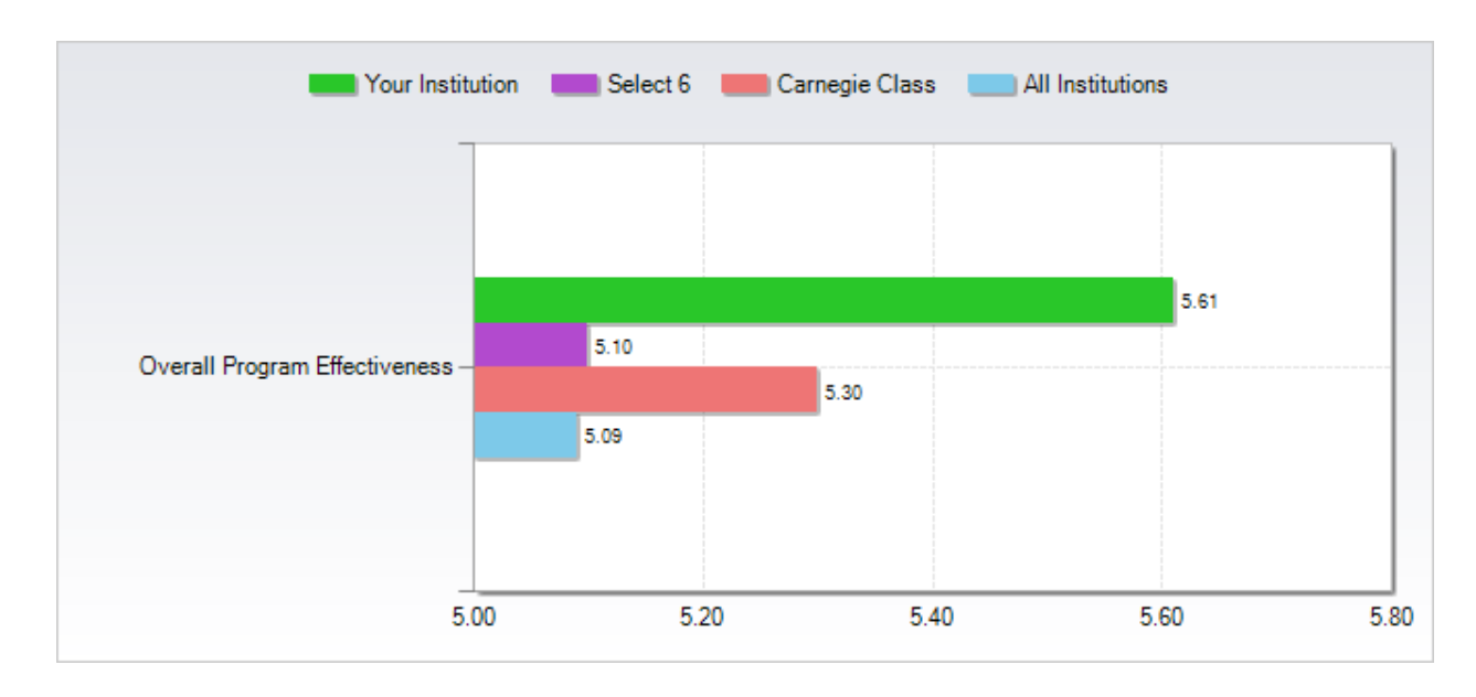
Figure 1: Overall Program Effectiveness.

Looking at the LEAP program over time (See Figure 2) we see that in 2014 there was marked improvement in student opinion on the overall effectiveness of their LEAP class.