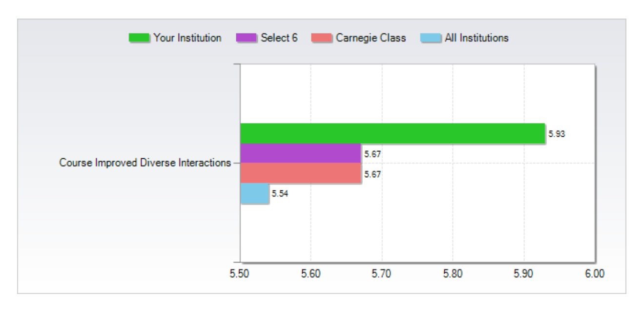
Figure 4: Diversity.

In terms of Diversity the LEAP program performs exceptionally well relative to other programs (See Figure 4). Though the EBI does not directly address Civic Knowledge and/or Civic Engagement the survey does assess connection with peers and social integration. In these areas LEAP could use some work (See Figure 5).